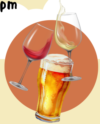
Beer & Wine